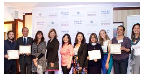
Right. Local Faculty Facilitators receive their certificates.