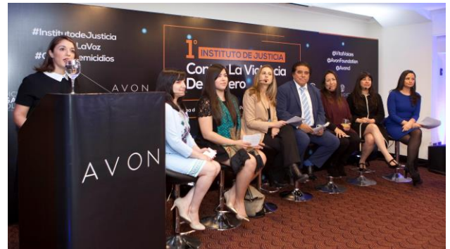
Above. Media Event panelists.